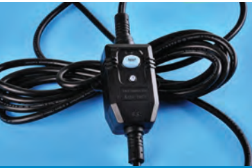
In-line RCD (Residual Current Device) 10amp