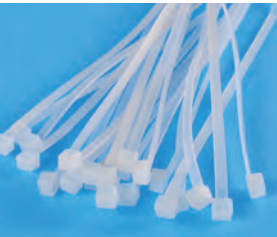
Plastic cable ties to fix trace heating cable & junction box to pipe