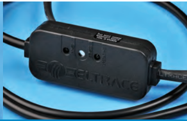
Ready made Self Regulating Heating Cable with In-Line Thermostat. Thermostat has indicator lights & switches at 5°C for minimum energy cost