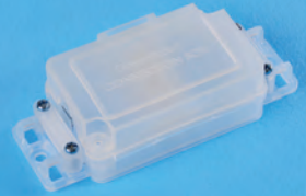
In-line Junction box with cable retention clamps to EN-60598-1 & BS4533 for increased safety